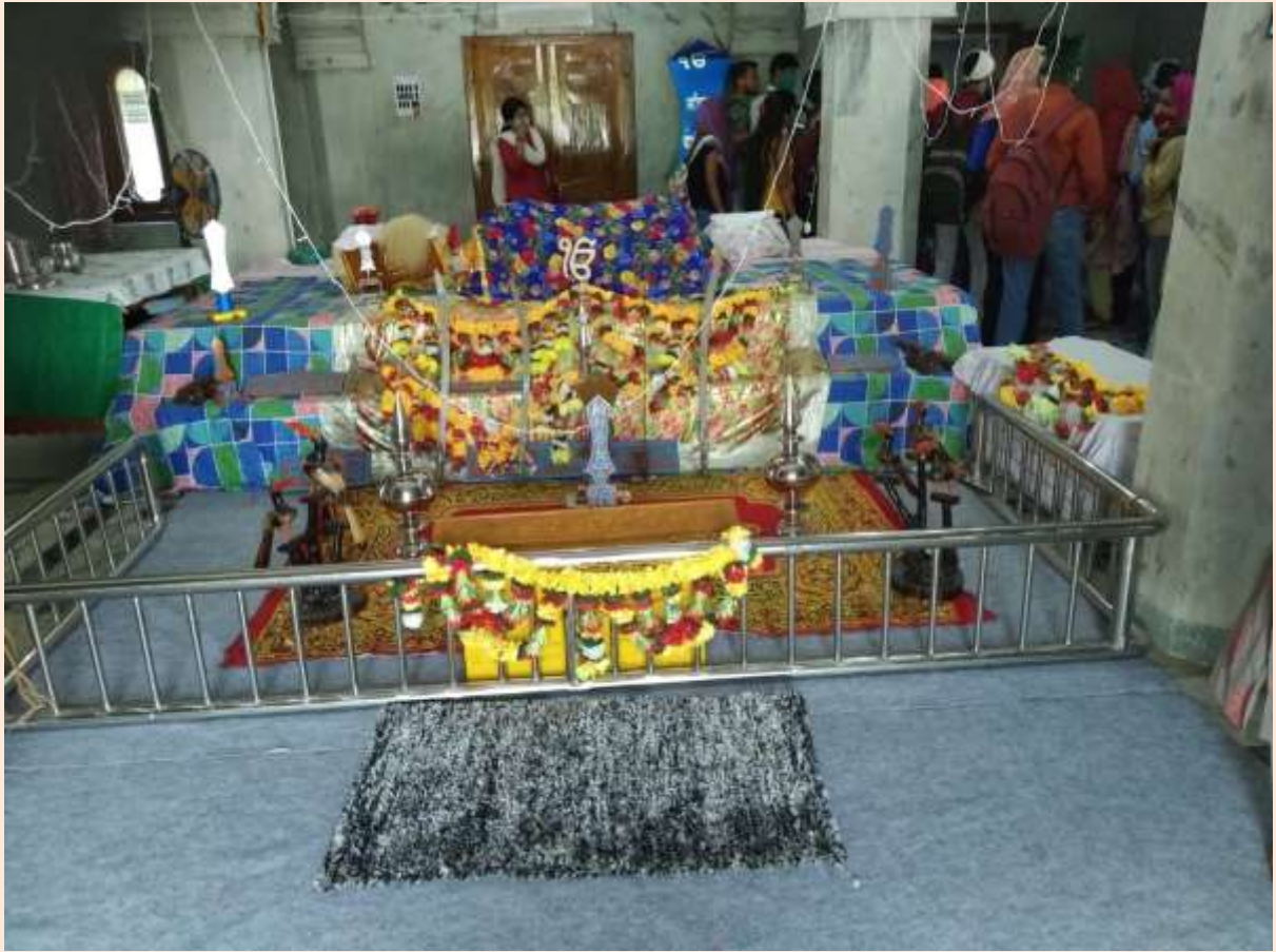
( NIMASARAI: GURUDWAR:12.04.2021)