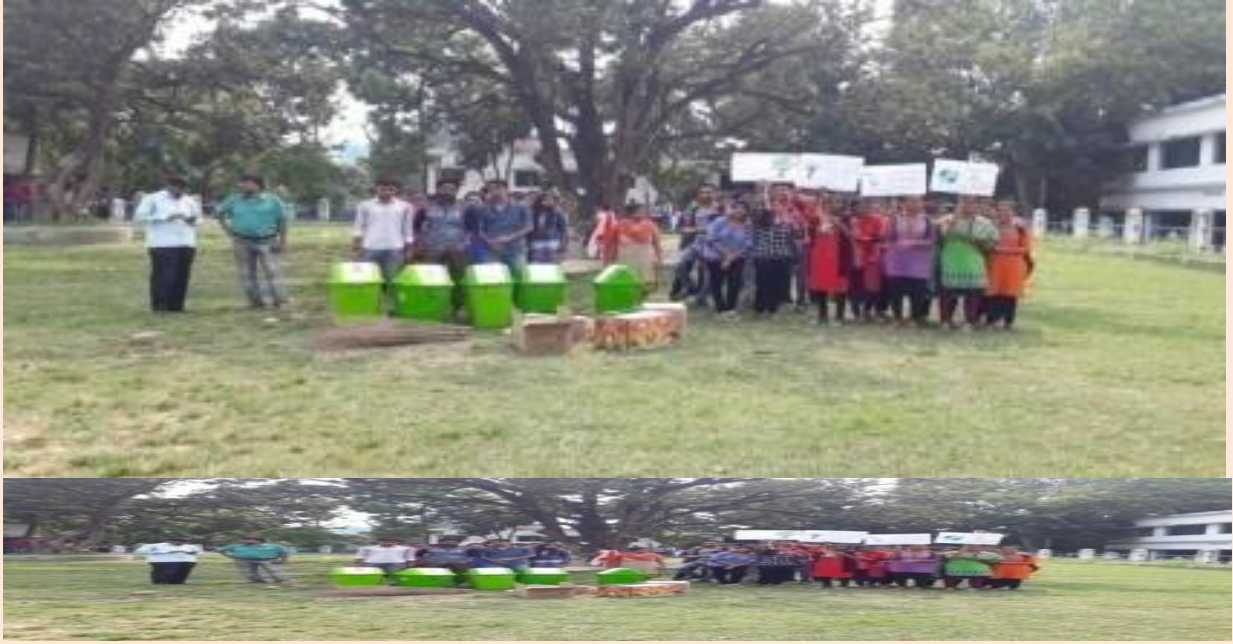
( SWACCH BHARAT ABHIYAN:20.4.2018)