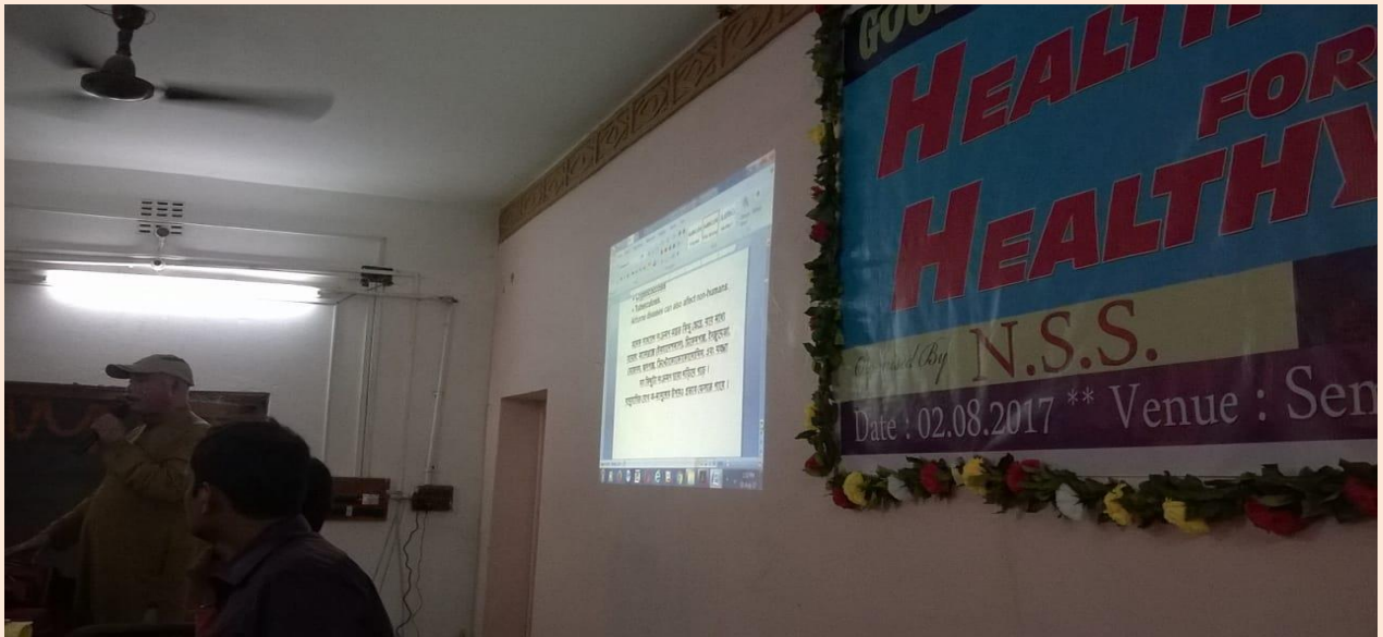
( SEMINAR: HEALTHY YOUTH FOR HEALTHY INDIA)