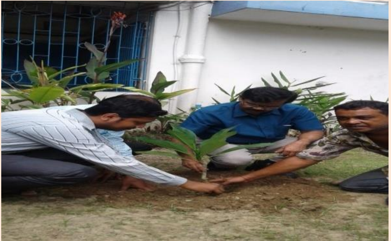
(Observation of AranyaSaptaha: Saplings plantation :18.7.2017: Venue :GourMahavidyalaya)