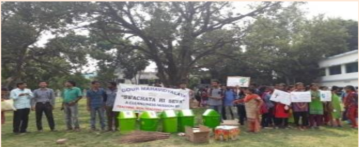
(SwacchBharatAbhiyan programme: Cleaning: College campus:Dustbin set up : College Campus:Date: 20.4.2018)