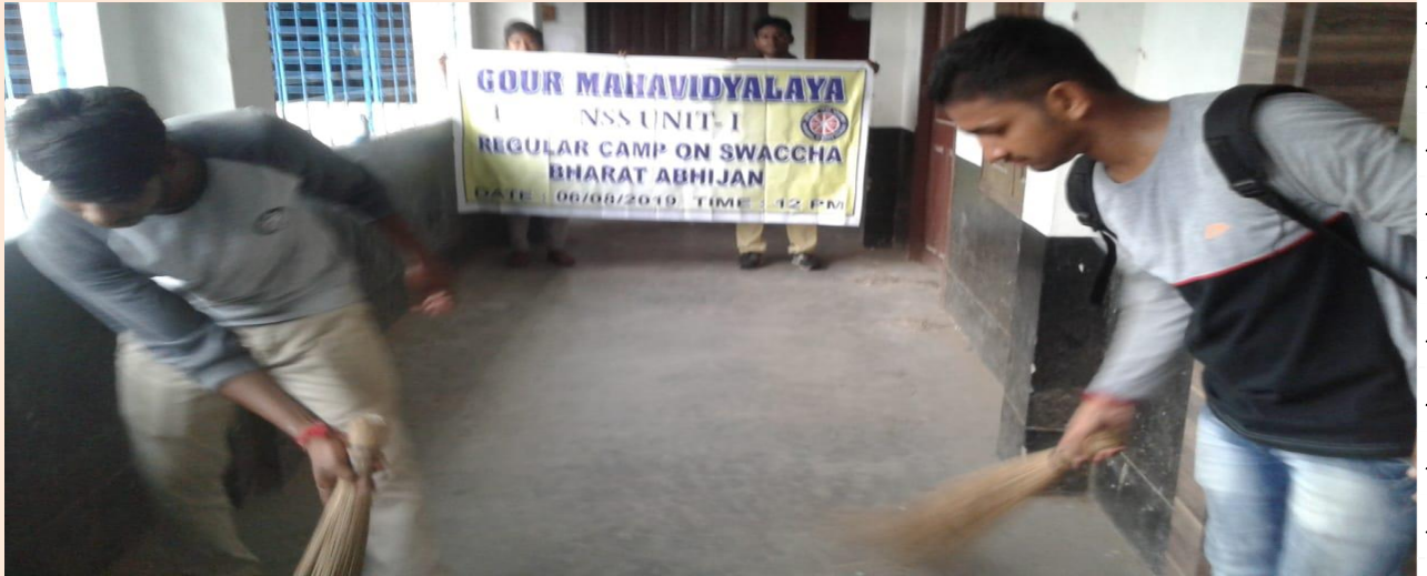
( SWACCH BHARAT ABHIYAN: CLEANING)