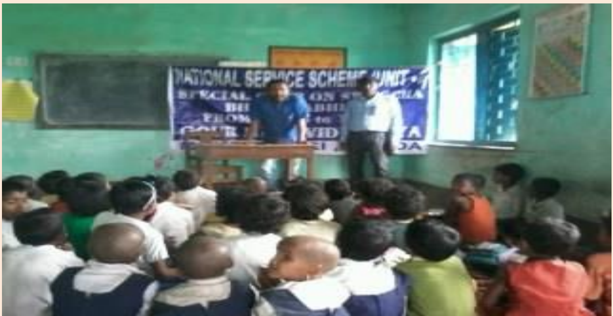
(LECTURE: CLEANLINESS,KAMANCHA PRYMARY SCHOOL)