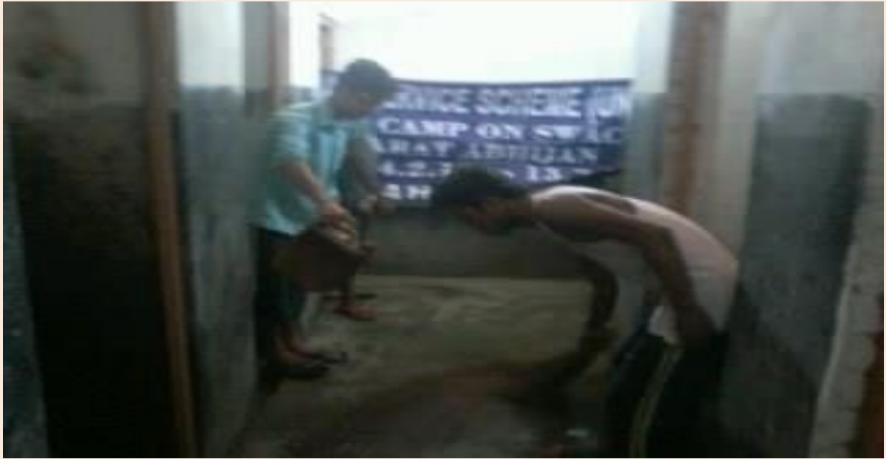
( SWACCH BHARAT ABHYAN:CLEANING: COLLEGE: BOYS' HOSTEL)