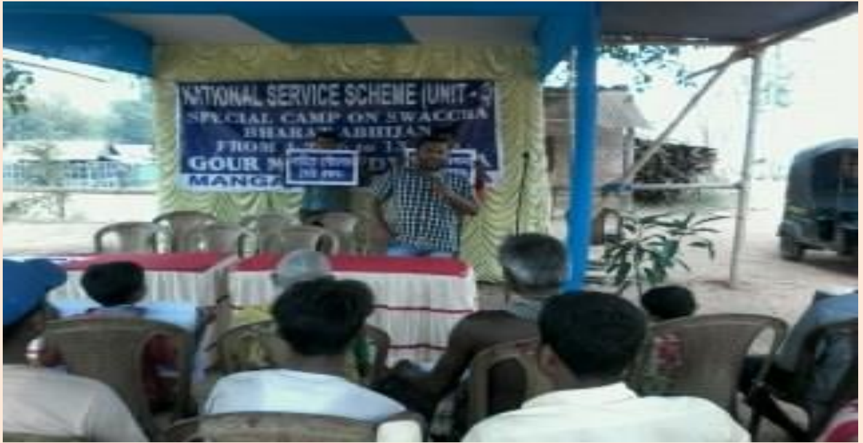
( SPECIAL CAMP AT VILLAGE KAMANCHA)