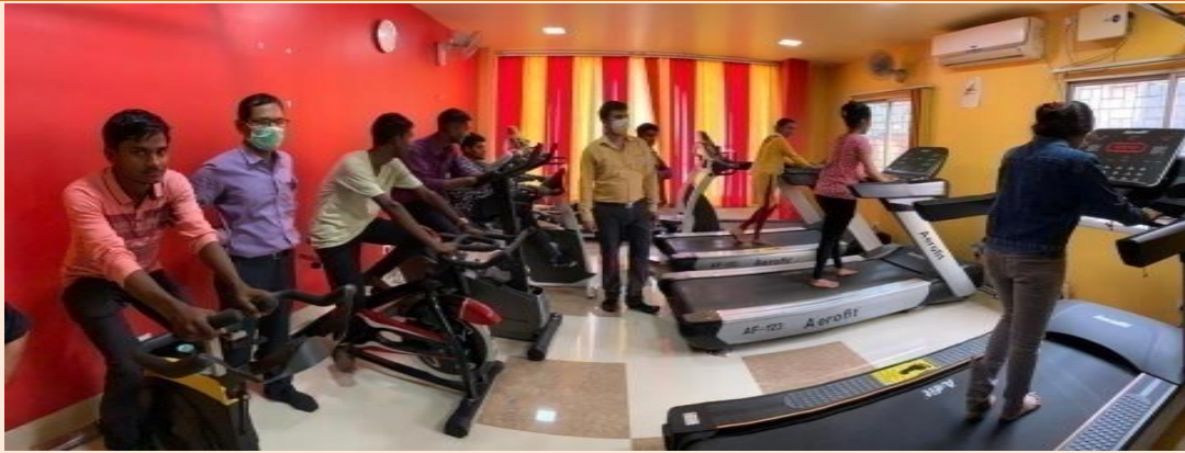
PHYSICAL EDUCATION:CBCS: SEMESTER1 and111-TOUR:15.03.2021,MALDA