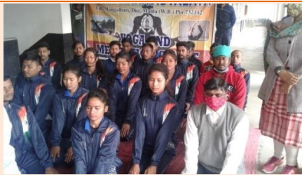
PRACTICAL : YOGA PRACTICE:18.04.2021)

1.EXPERIMENTAL LEARNING: One example of experiential learning is going to the zoo or factory or Yoga centre and learning through observation and interaction with the environment, as opposed to reading about animals, production system in a factory or practice of Yoga from a book. Thus, one makes discoveries and experiments with knowledge firsthand, instead of hearing or reading about others' experiences.