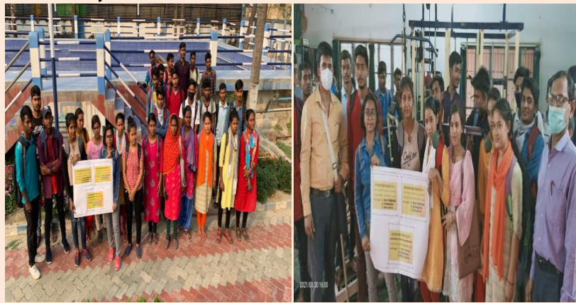
PHYSICAL EDUCATION:CBCS:SEMESTER 1 and111-TOUR:15.03.2021: YOGA CENTRE,MALDA

(d).Exhibition: Students organize exhibition,and show their creativity.