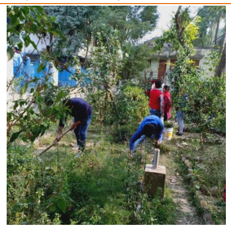
(GARDEN: CLEANING, MANURING)

Garden: Many Gardens have been developed: (No.1). Flower Garden (No.1):372"922".(2). Flower Garden (No.2):511"-517".(3). Flower Garden (No.3):508"-119".(4). Flower Garden (No.4):385"-415".(5). Flower Garden (No.5).:237"-294".(6). Garden of Medicinal plants:669"-116".(7). Garden of Medicinal plants (No.2):610"-1189", (8). Garden in front of Library)(9). Exsitu conservation garden (NO.1).(10). Herbarium (NO.1) and (11). Arboretum .The Beautification Committee looks after the matter of gardening. The college gardens are maintained by the gardener appointed by the institute( expenditure incurred in connection with gardening—Rs.34,160/).