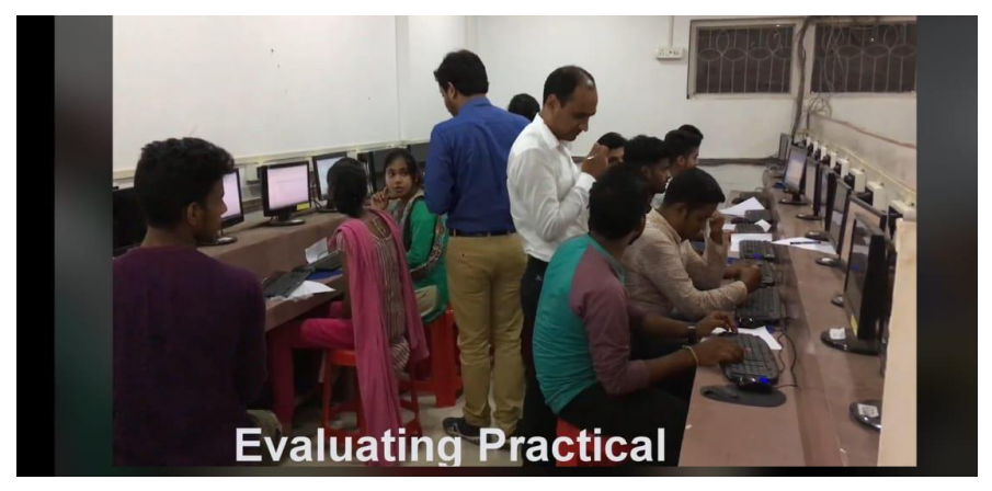
( LABORATORY: COMPUTER SCIENCE)

Library: The College Library is a well equipped one with approximately27000books. Reference books are bought this year It has two well furnished reading rooms, one for the students and the other for the teachers. The library Committee has been constituted. The library is headed by Assistant Librarian .She is supported by clerks for Journal and lending sections. INFLIBNET facility with online journals, e-books from Taylor and Francis group is available for the teachers and students.LYBSIS is being used for library automation. Apart from the Central Library ,4 Departments have Seminar Libraries to meet the demands of the students and teachers (Books-Rs.4,89,382/;Book binding-Rs.2,180/).