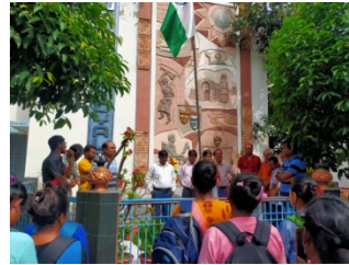
Observation of the Independence Day