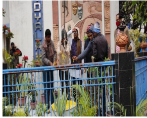
Observation of the Republic Day