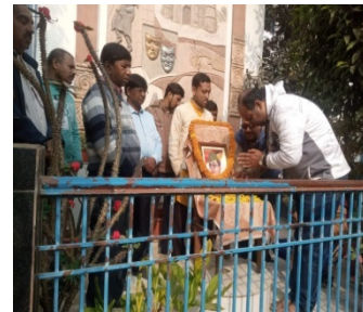
OBSERVATION OF SUBHASH CHANDRA BASU BIRTH DAY