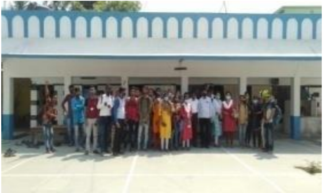
18.03.2021: Old Malda Nimasari Gurudwara: Educational Tour