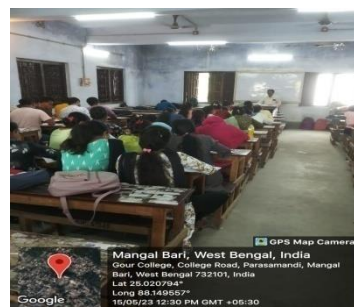
ADVANCED LEARNERS CLASS