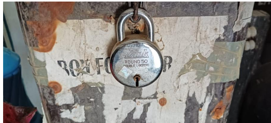
GOUR MAHAVIDYALA,MALDA, GRIEVANCE/COMPLAIN LETTER BOX