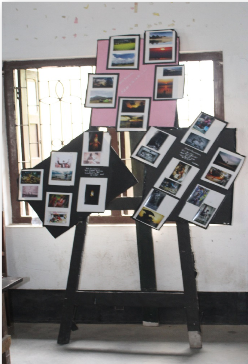
ILLUSTRATION OF DIVERSITY