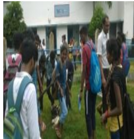
SWACCH BHARAT ABHIJAN