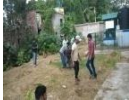
SWACCH BHARAT ABHIJAN