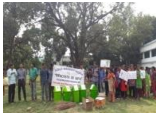
SWACCH BHARAT ABHIJAN