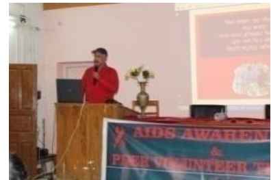
WORLD AIDS DAY