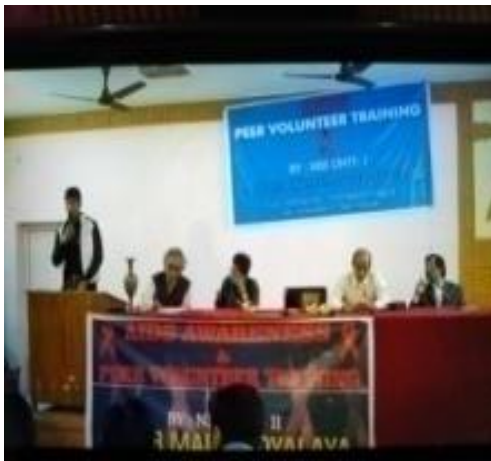
1.12.2017: WORLD AIDS DAY

Observation of World Environment Day:5.6.2018:Spalings plantation: Venue: GourMahavidyalaya: Our volunteers planted32 saplings at college campus.