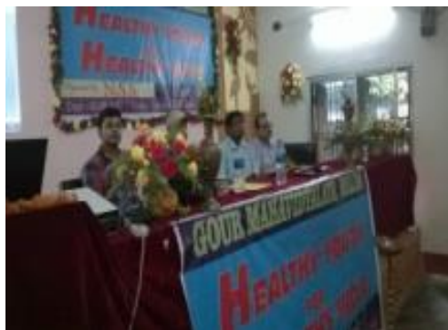
HEALTHY YOUTH FOR HEALTHY INDIA