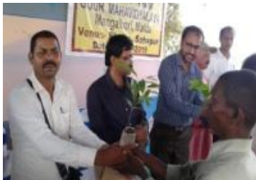
SAPLINGS DISTRIBUTION: VILLAGA KAMANCHA