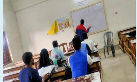
MENTOR & MENTEE MEETING ADVANCE EARNERS) : SEM -2 OFFLINE: DATE: 08.02.2021