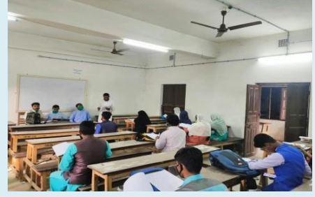
TUTORIAL EXAMINATION: SEM- IV: OFFLINE: 12.03.2021