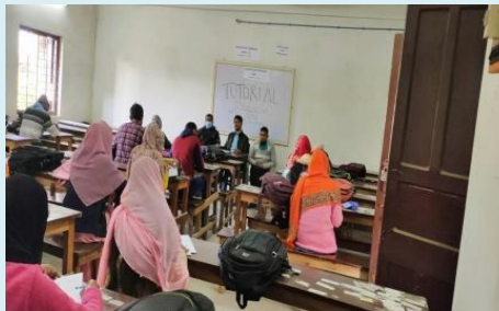
ADVANCE & SLOW LEARNER: SEM : 2 OFFLINE: 03.03.2021