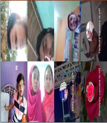
ONLINE CLASS: SEM - III: 01.10.2020