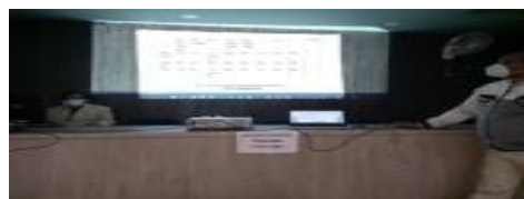
( ICT enabled Virtual Class / Seminar Room)