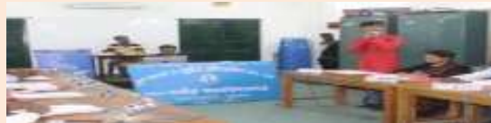
Rehearsal: Students: Mock Parliament