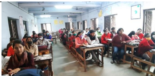
SOCIOLOGY: CBBCS- SEMESTER- 1_ORIENTATION:8.9.2020)