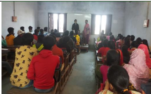
HISTORY: SEMESTER-1- CEBCS-ORIENTATION.

3. Teaching and learning system; Orientation, Tutorial examinations, student seminar, tour, preparation of project report.