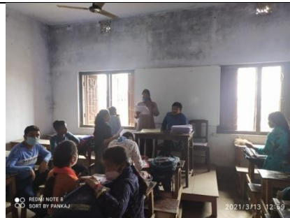
HISTORY: SEMESTER- 1-CEBCS-STUDENT SEMINAR.