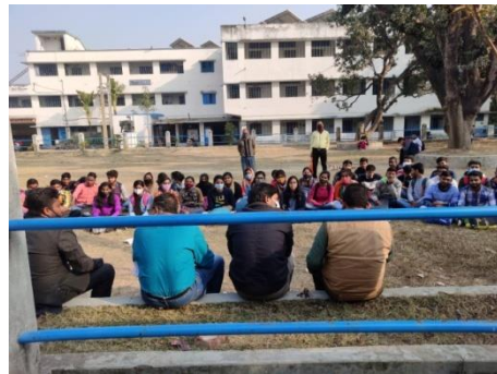
ENGLISH: CBBCS- SEMESTER-1- ORIENTATION.