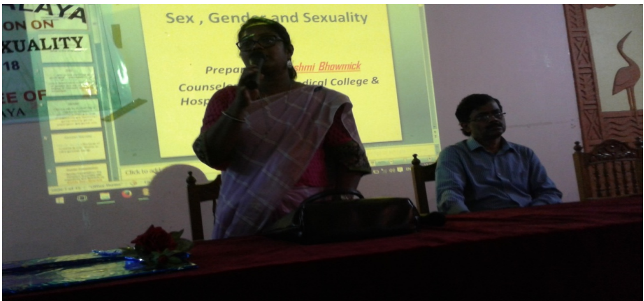
BISHAKHA COMMITTEE, GOUR MAHAVIDYALAYA, MANGALBARI, MALDA: LECTURE ON SEX, GENDER AND SEXUALITY, SEMINAR HALL.GOUR MAHAVIDYALAYA, MANGALBARI, MALDA.5.10.2018.