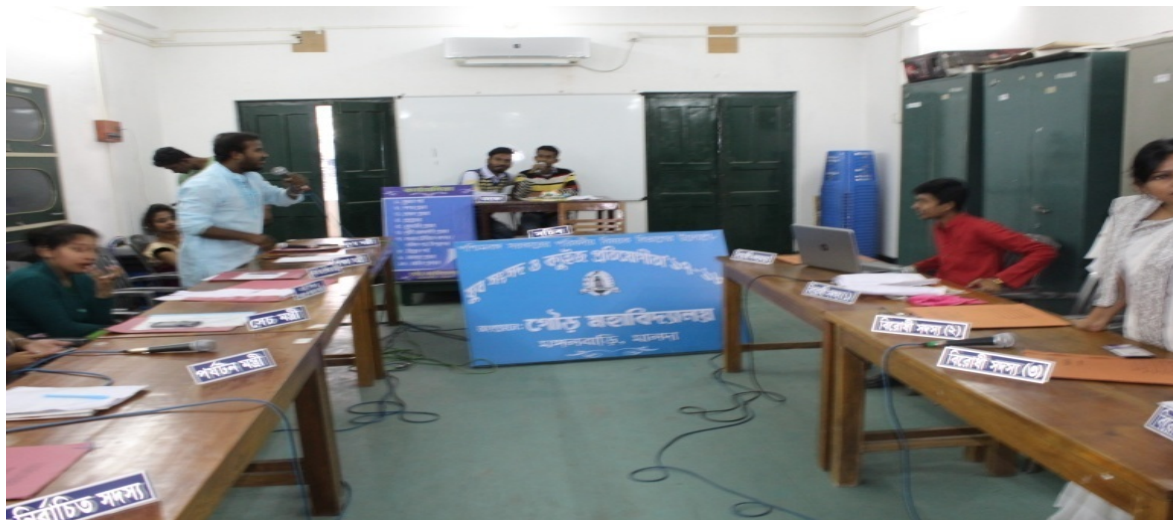
Youth Parliament: Dept:Political Science