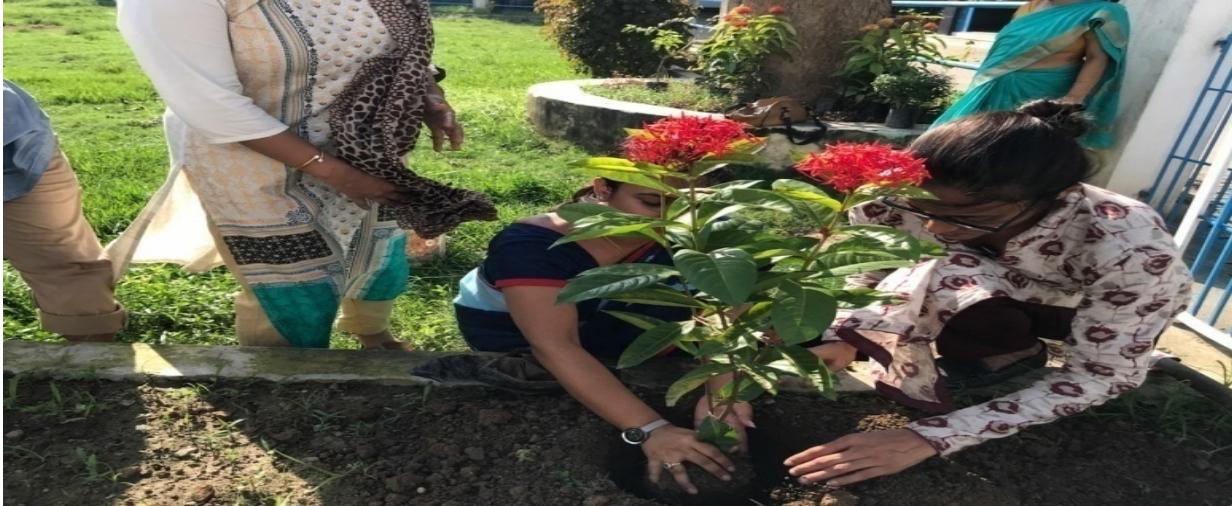
BEAUTIFICATION COMMITTEE: ARANYA SAPTAHA: PLANTATION OF SAPLINGS

BEAUTIFICATION COMMITTEE, GOUR MAHAVIDYALAYA: SWACCH BHARAT ABHIJAN: COLLEGE CAMPUS: DATE: 21.7.2018