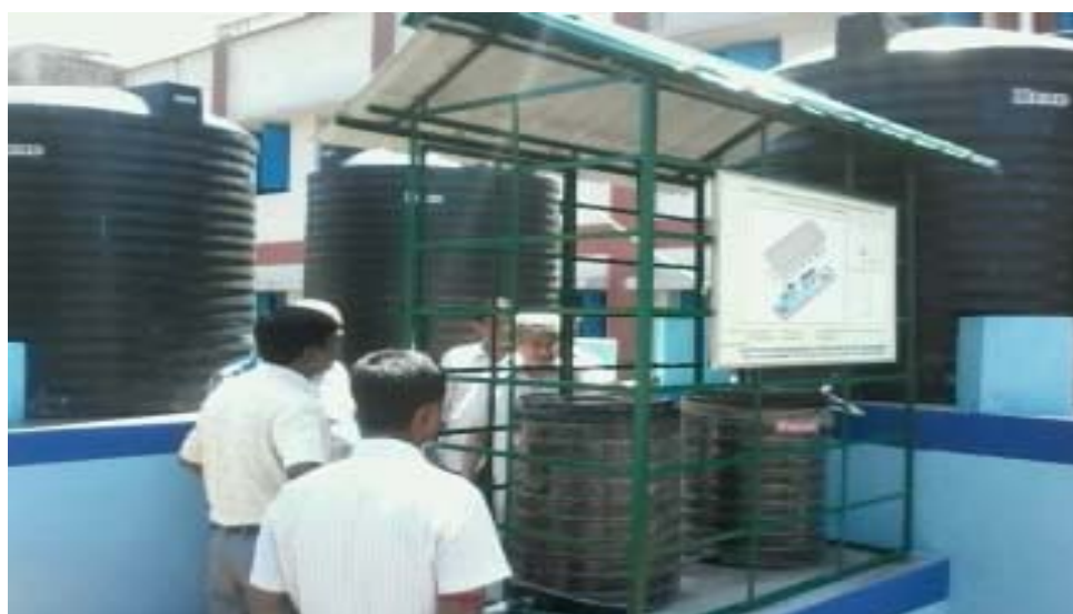
Rain Water Harvesting Plant, Gour Mahavidyalaya Malda .

There is a pressing need to accelerate the development of advanced clean energy technologies in order to address the global challenges of energy security, climate change and sustainable development. In today's scenario solar power is one of the best solution to overcome the energy deficit in the World. The generation of solar power does not have any adverse effect on the environment. The plant provides substantial cost savings on the power consumption for the college. One of the biggest challenges of the 21 st century is to overcome the growing water shortage. Rainwater harvesting has thus regained its importance as a valuable alternative or supplementary water resource. Green campus initiative helps to create environmental awareness. Students and teachers have shown responsible attitudes and commitment to the environmental enrichment.