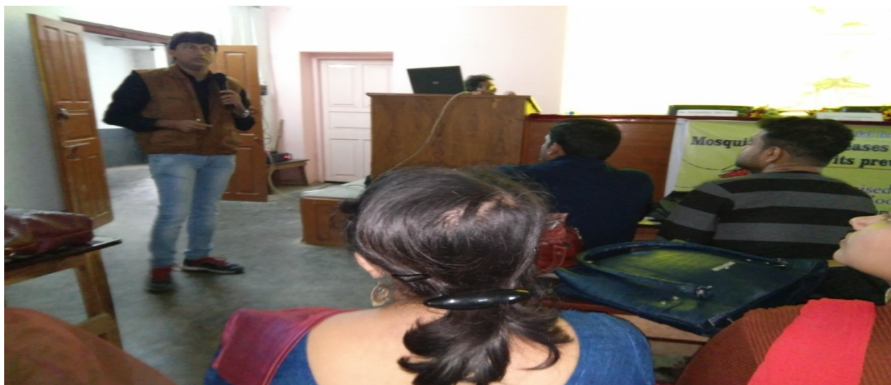
“Mosquito borne diseases in and around Malda and its prevention”- Department of Zoology, Gour Mahavidyalaya - 8 .12.2017.